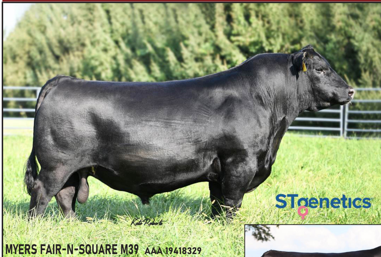
MYERS FAIR-N-SQUARE M39 AAA 19418329

CONNEALY CONFIDENCE PLUS WOODHILL BLUEPRINT WOODHILL EVERGREEN Z291-B233 MYERS FAIR-N-SQUARE M39 CONNEALY THUNDER MYERS MISS BEAUTY M136 MYERS MISS BEAUTY M476 CONNEALY CONFIDENCE 0100 ELBANNA OF CONANGA 1209 VAR ALLEGIANCE 5157 MALSONS SAVANNAH 27W BALDRIDGE KABOOM K243 KCF PARKA OF CONANGA 241 CONNEALY ONWARD MYERS MISS BEAUTY M384