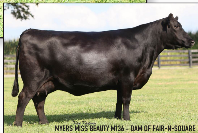
MYERS MISS BEAUTY M136 - DAM OF FAIR-N-SQUARE